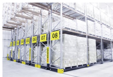
Mobile Pallet Racking