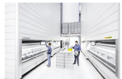
Vertical Storage Lift LogiMAT®