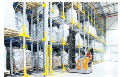
High Density Storage Systems