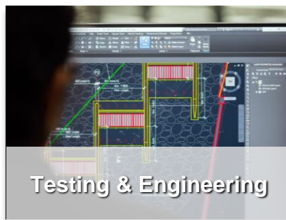
Testing & Engineering